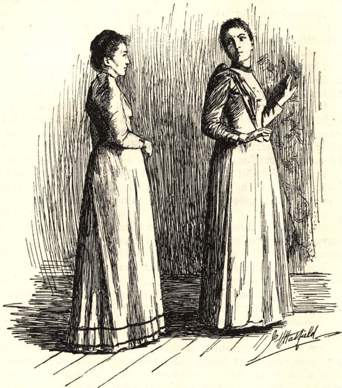
“She didn't know I was in the Room.”

John says I mustn't lose my strength, and has me take cod liver oil and lots of