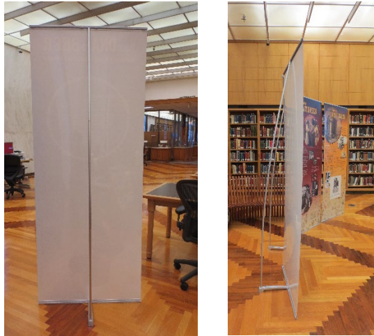
Installation rear and side views