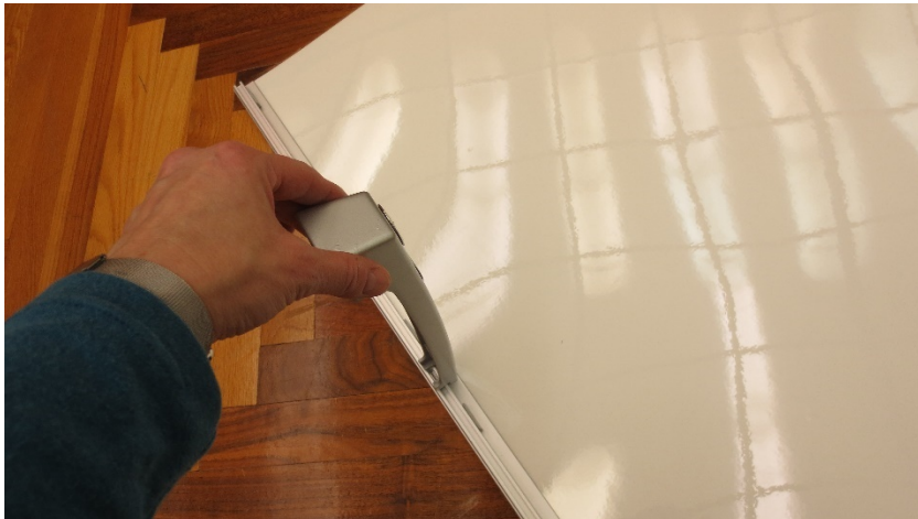
Remove by lifting up