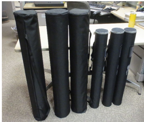
Large and small cylindrical bags