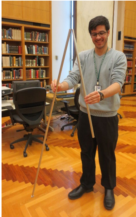
Collapse the pole

Collapse the pole by pulling it slightly apart and folding it onto itself.