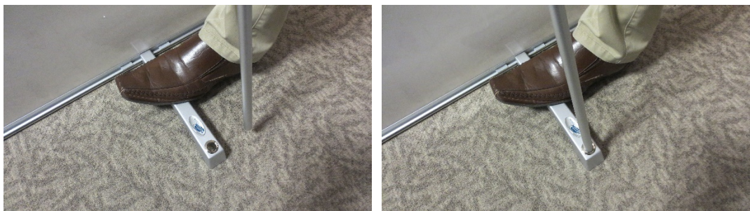
With foot on metal base insert pole into base

If the banners do not stand up properly, check that the pole is inserted completely into the base. Remove the pole and re-insert it while making sure that the pole is perpendicular to the base. Also, check that poles are not bent as this will cause the banners to torque and twist when standing.