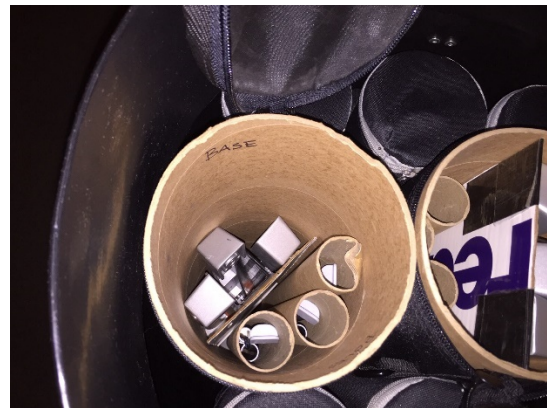
3 poles and 3 bases packed in large cylindrical bag