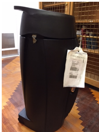
Attach hang tag with plastic tie on side of container