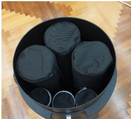
Pole and base packed in small bag