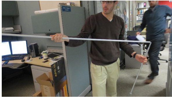
Pole sections are attached with elastic cord.