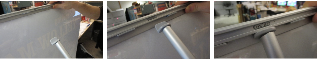
Hold banner in upright position and insert rod into banner top.