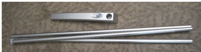
One pole and one base