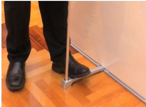
Place foot on base and pull out pole.