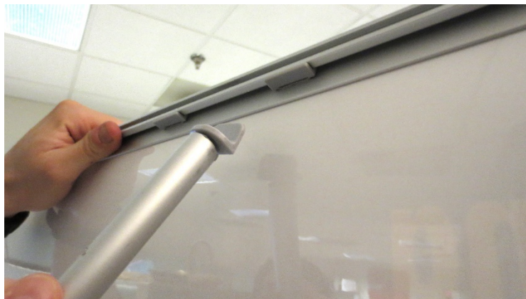
Remove pole from top of banner