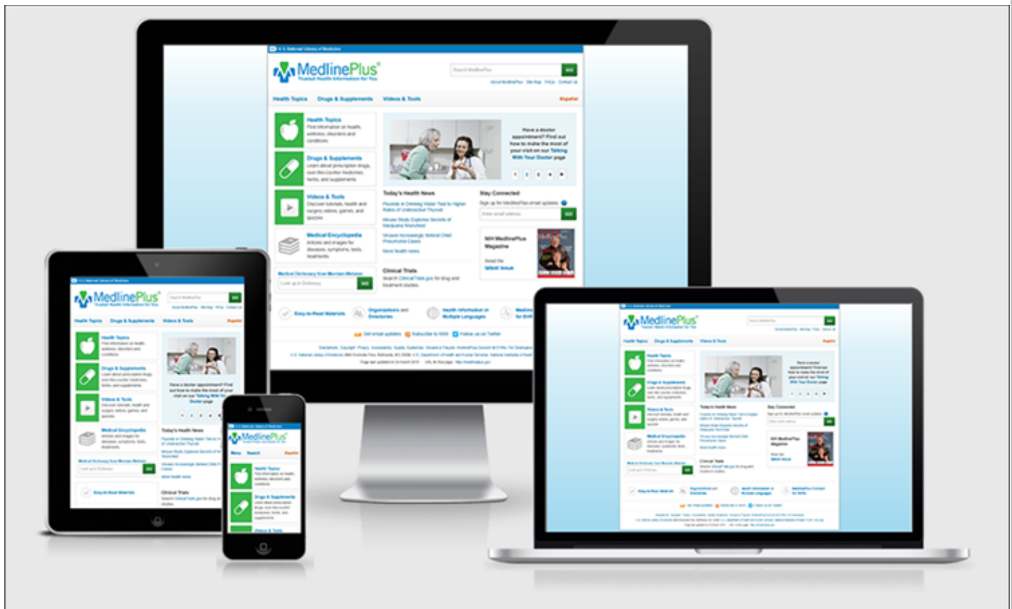
Figure 1: New homepage designs for MedlinePlus on a tablet, desktop, smartphone, and laptop.

Responsive Web Design optimizes your interaction with a site by adjusting each page for the device you are using, whether that is a desktop monitor or mobile touchscreen. Responsive pages automatically change their layout to fit your screen.