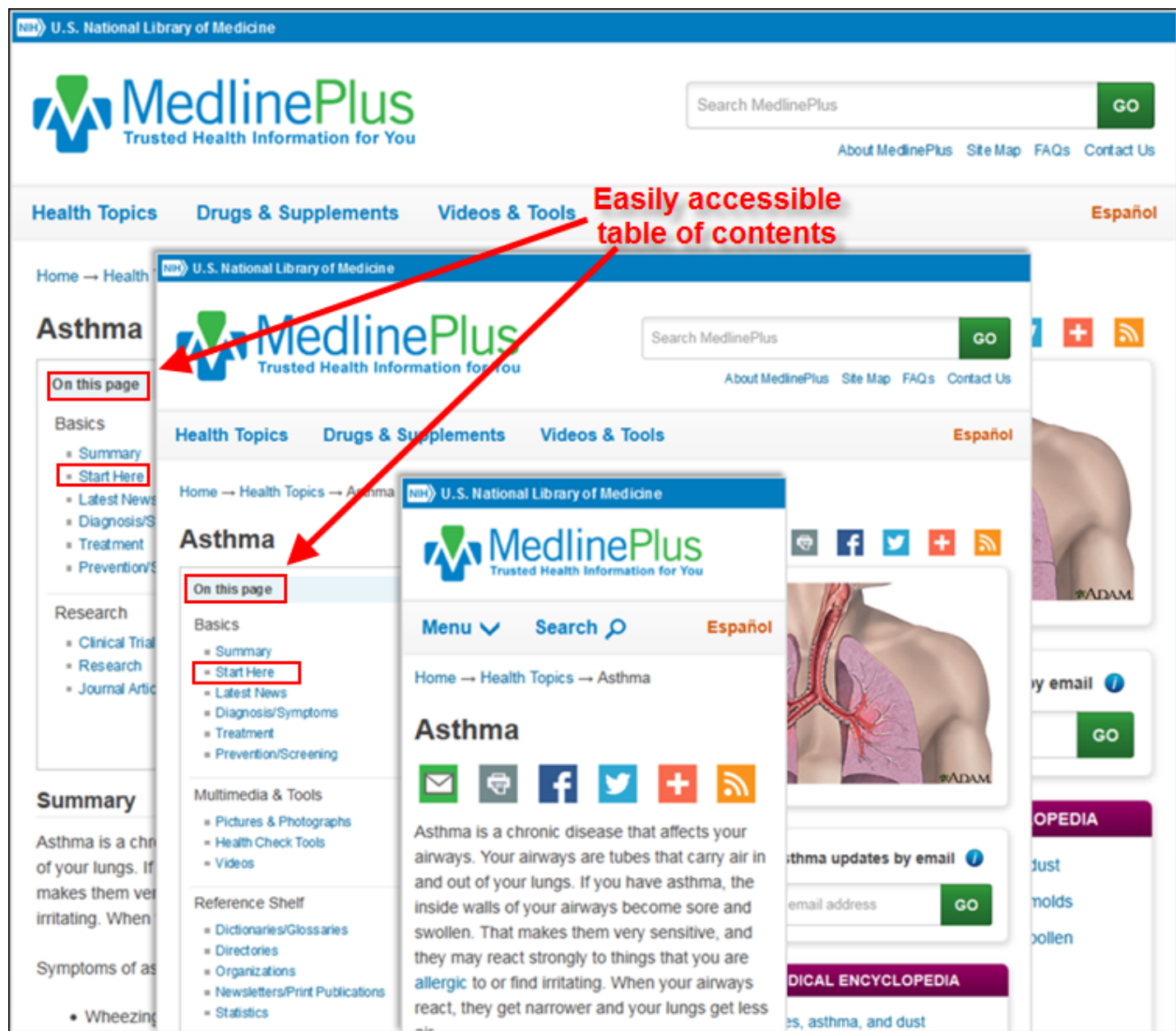
Figure 4: New Health Topic page designs for MedlinePlus on a desktop, tablet, and smartphone.

Mobile and tablet users will also enjoy: