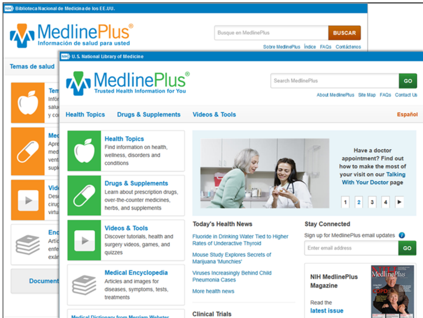
Figure 3: The new homepage layout.

Health Topic pages boast an improved architecture, with the table of contents (On this page) now appearing above the topic summary for easy access. Additionally, the Overviews section has been merged into the Start Here section, now found just below the topic summary.