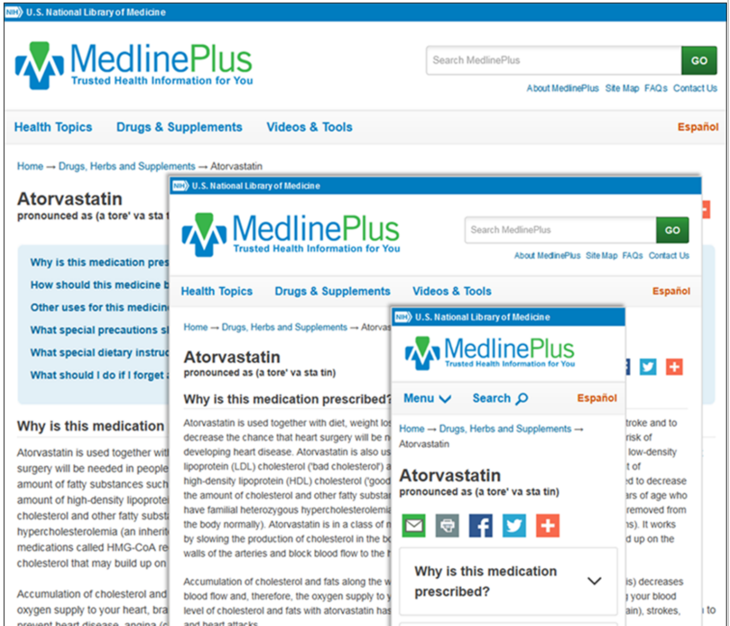
Figure 2: Find health information on a desktop, tablet, and smartphone.